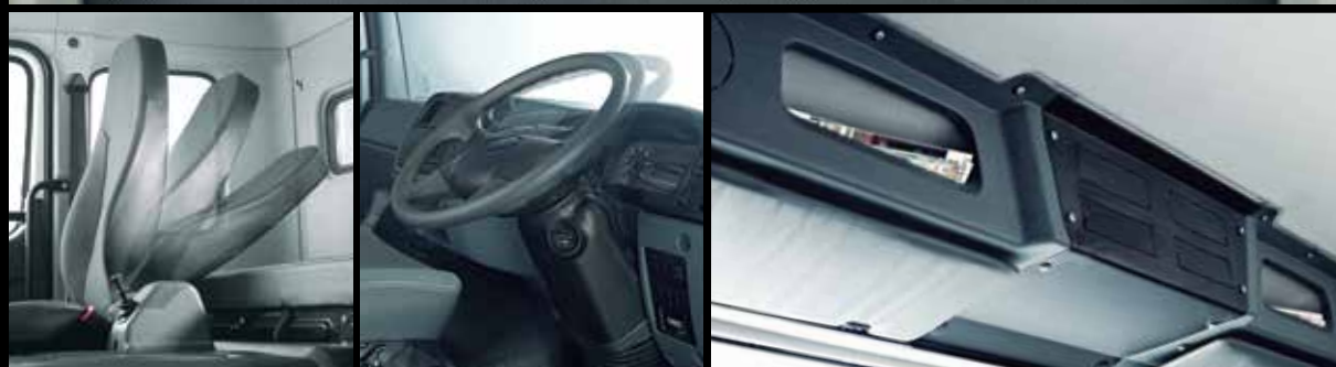
Convenient overhead console box.